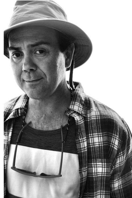
Joe Lo Truglio

Known for: PITCH PERFECT TRUE BLOOD GOOD GIRLS REVOLT