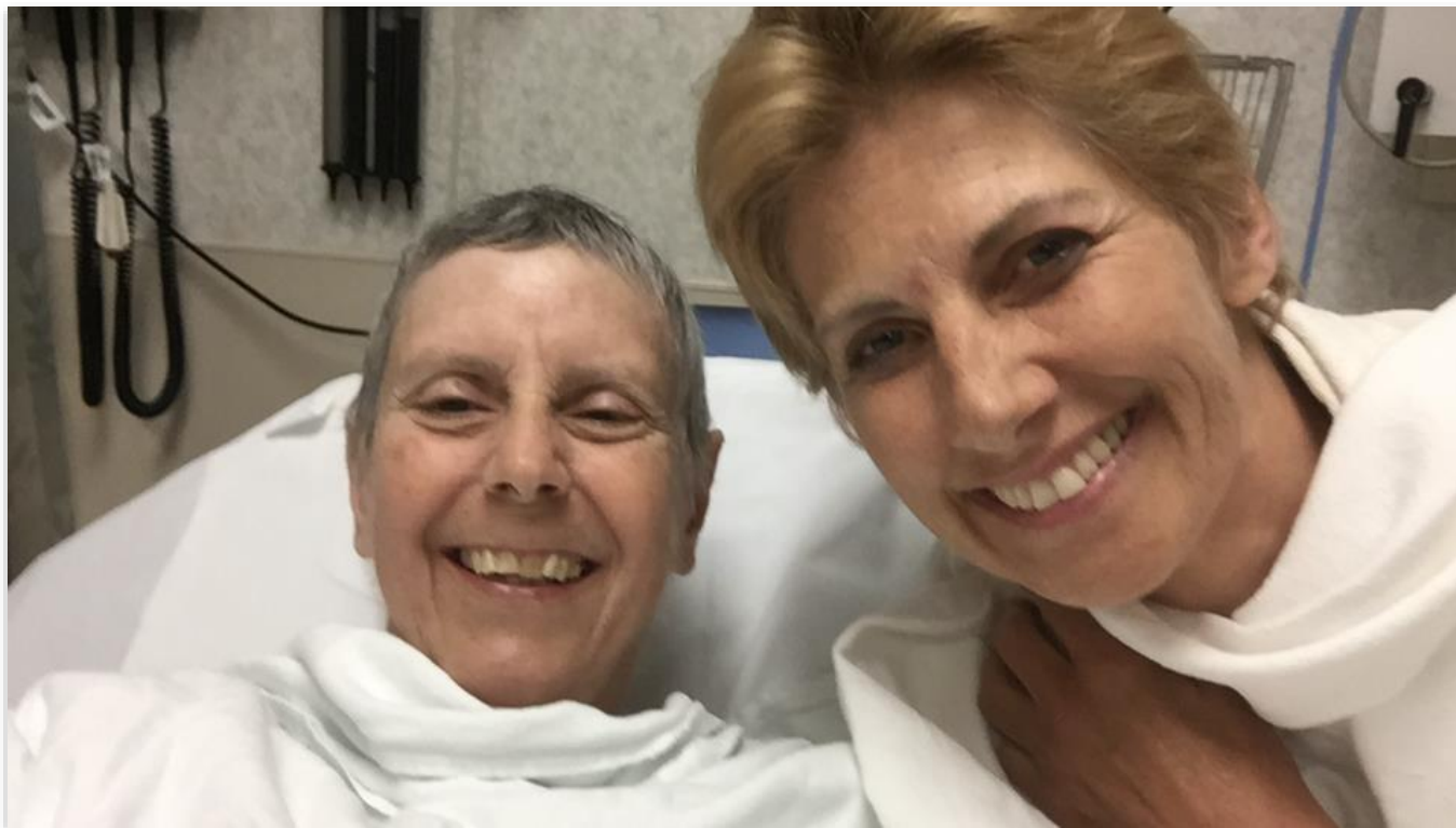
In the emergency room, nine months into our journey. (June 2015)